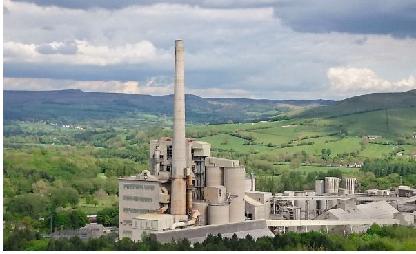
7 Breedon's Hope Cement Works

cannons use a 150 l tank for maximum power to clear the “rhino’s horn” build-up at the tips. The Hurricane arrays can handle the frequent firing required to keep things clean, and the high pressure air system is monitored centrally so the team can