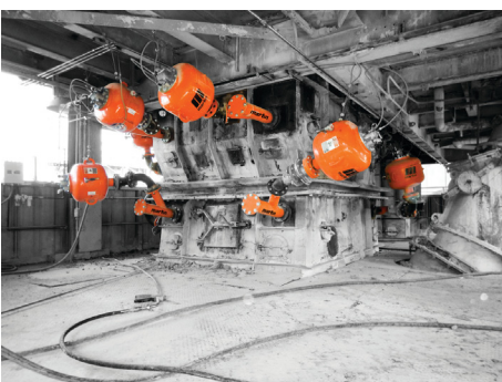
3 A series of air cannons can be programmed to deliver precisely-timed blasts to maximise benefit and maintain flow

Bringing cement production equipment up to operating temperature takes a tremendous amount of energy. The cost of downtime for cooling the system, performing maintenance work and reheating the kiln can be prohibitive. So