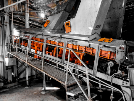
2 Modern transfer design eases the transition of materials, reducing the chances of a blockage to maintain material flow

A transfer point is similar to a gravity settling chamber, which depends on relatively slow air speed without much turbulence. Conversely, the airflow through a conveyor transfer point is almost always turbulent. So, the transfer point enclosure design needs to incorporate a series of curtains to slow and control airflow and promote settling. Used in tandem with adjustable dual skirting, these can create a sealed environment where dust settles back into the cargo flow or is sequestered into a dust bag without spillage or emissions.