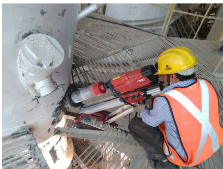
5 Core drilling is a careful and precise process to ensure there is no cracking in the refractory

Not only does advanced engineering mean that servicing of air cannons can take place without the need to stop production, but Martin recently launched a patented technology that even enables them to be fully installed without a process shutdown. This system allows specially-trained technicians to mount the units on furnaces, pre-heaters, coolers and other high-temperature locations while production continues uninterrupted. Specialized core drill bits are engineered