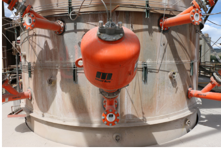
4 The outward facing valve allows safe servicing by one worker without a shutdown

modern air cannons are designed to be easily serviced from outside as individual units, for example Martin's Y-pipe assembly can be maintained without shutting down production. And to avoid the need for tank removal and confined space entry, engineers have designed new cannons with outward-facing valves. This provides safe, easy access by a single maintenance worker from outside the vessel.